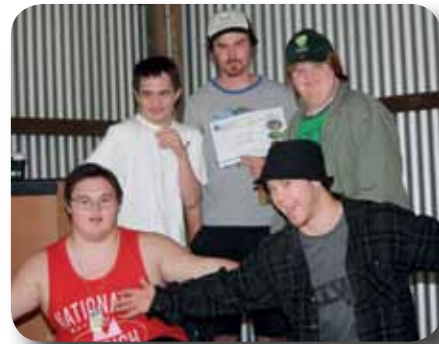
DSAQ members & volunteers enjoyed Camp at Petrie.

The year began with a regional visit to Mackay, followed by Townsville, the Gold and Sunshine Coasts, Rockhampton, Ipswich and Bundaberg. May 2011 saw the annual DSAQ Camp arrive with a vengeance. Forty adults with Down syndrome and 18 volunteers tackled the YMCA campsite at Petrie.